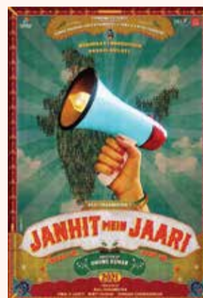
Janhit Mein Jaari 7.4/ 10