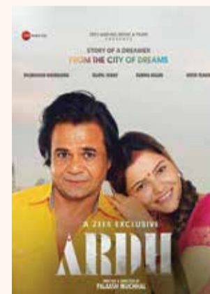
Ardh 8.0/ 10