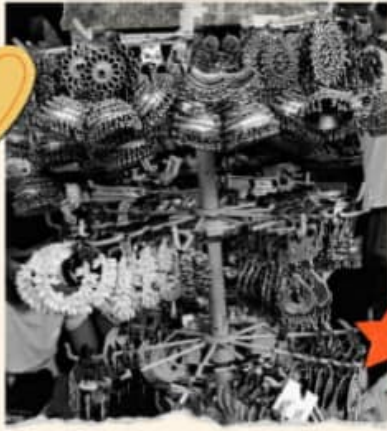
- Shreshtha Gogna