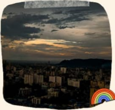
- Tasbiya Tanwar