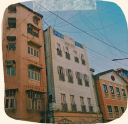
- Kunal Harpale