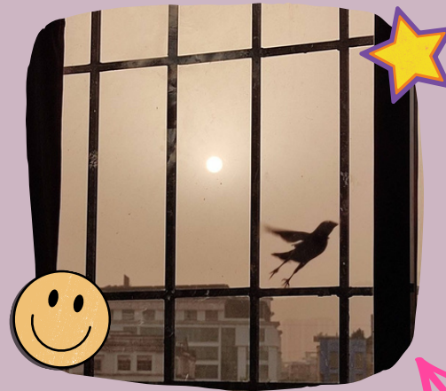
~ Heer Panchal