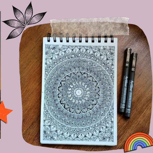
~ Hetvi Panchal