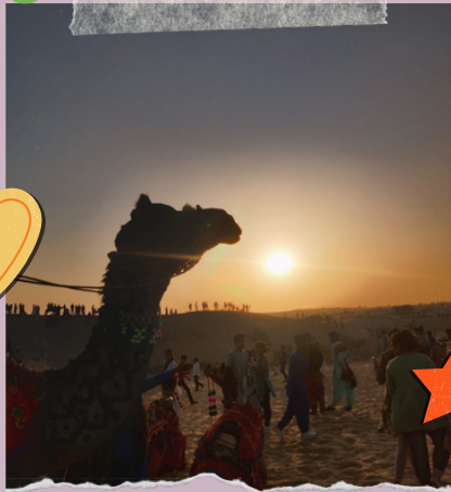
~ Shreshtha Gogna