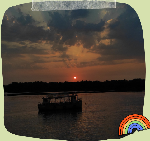
~ Khushi Vira