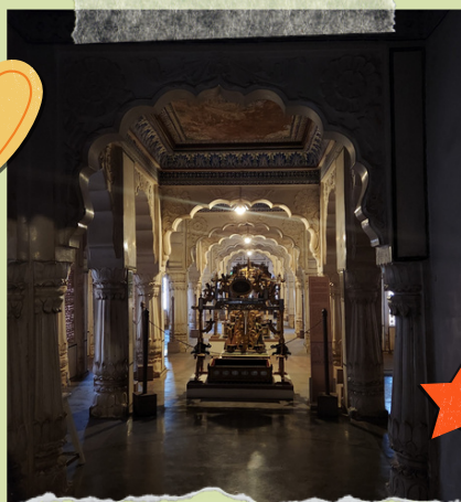
~ Akash Ralkumbhe