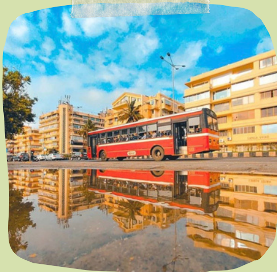
~ Pratham Soni