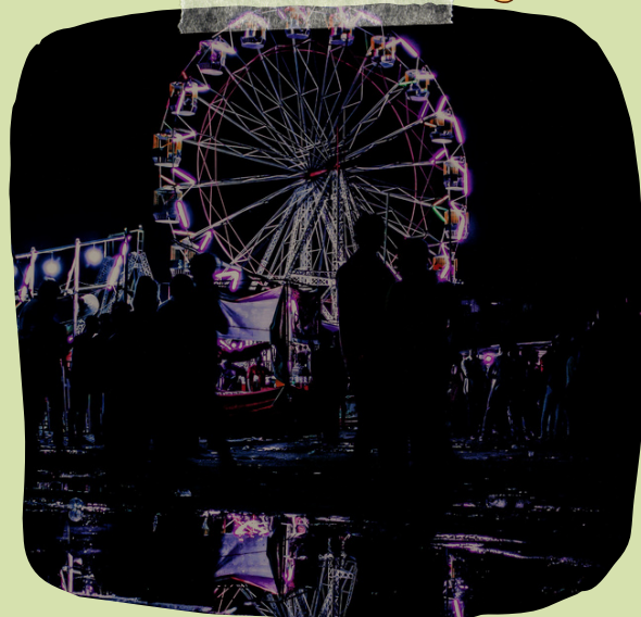
~ Navin Nair