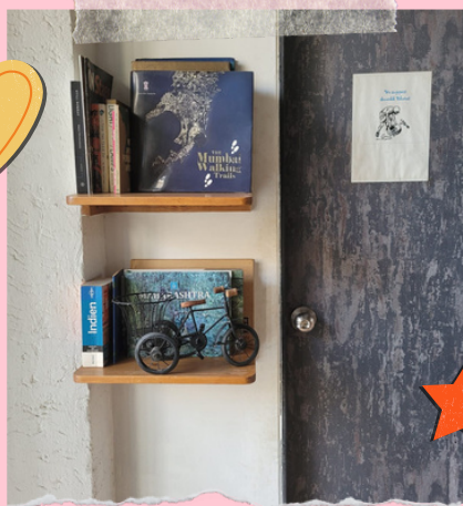
~ RIYA BAGHWE