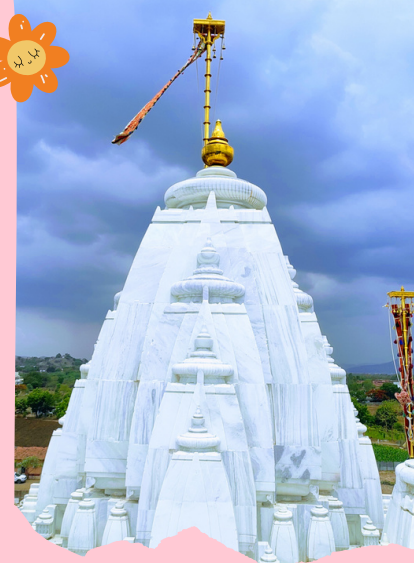
~ KHUSHI VIRA