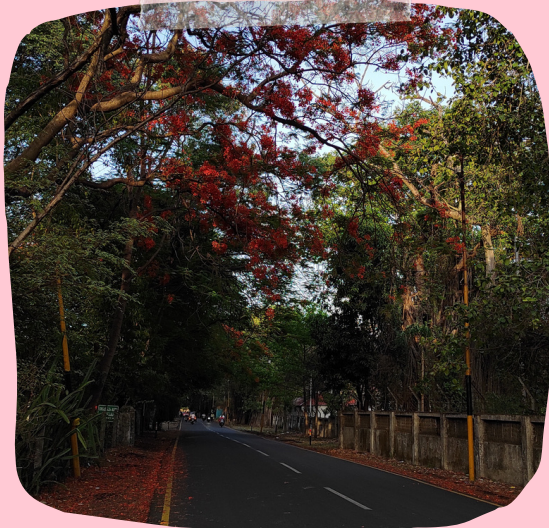
~ KHUSHI VIRA